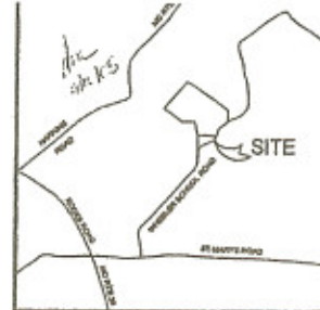
VICINITY MAP SCALE: 1" = 200'